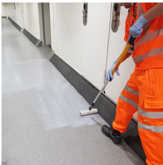
Figure 3: Applying Recoat Floor at 11.45 PM, finished at 01.03 AM. The floor was dry to walk at 05.30 AM