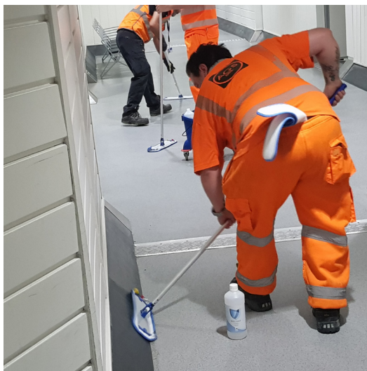
Figure 1: Applying Recoat Cleaner at 9.45 PM

Start applying the treatment at 9:45 PM | Floor is dry to walk on at 05:30 AM.